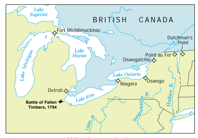
American Posts Held by the British After 1783

President Washington's far-visioned policy of neutrality was sorely tried by the British. For ten long years, they had been retaining the chain of northern frontier posts on U.S. soil, all in defiance of the peace treaty of 1783. The London government was reluctant to abandon the lucrative fur trade in the Great Lakes region and also hoped to build up an